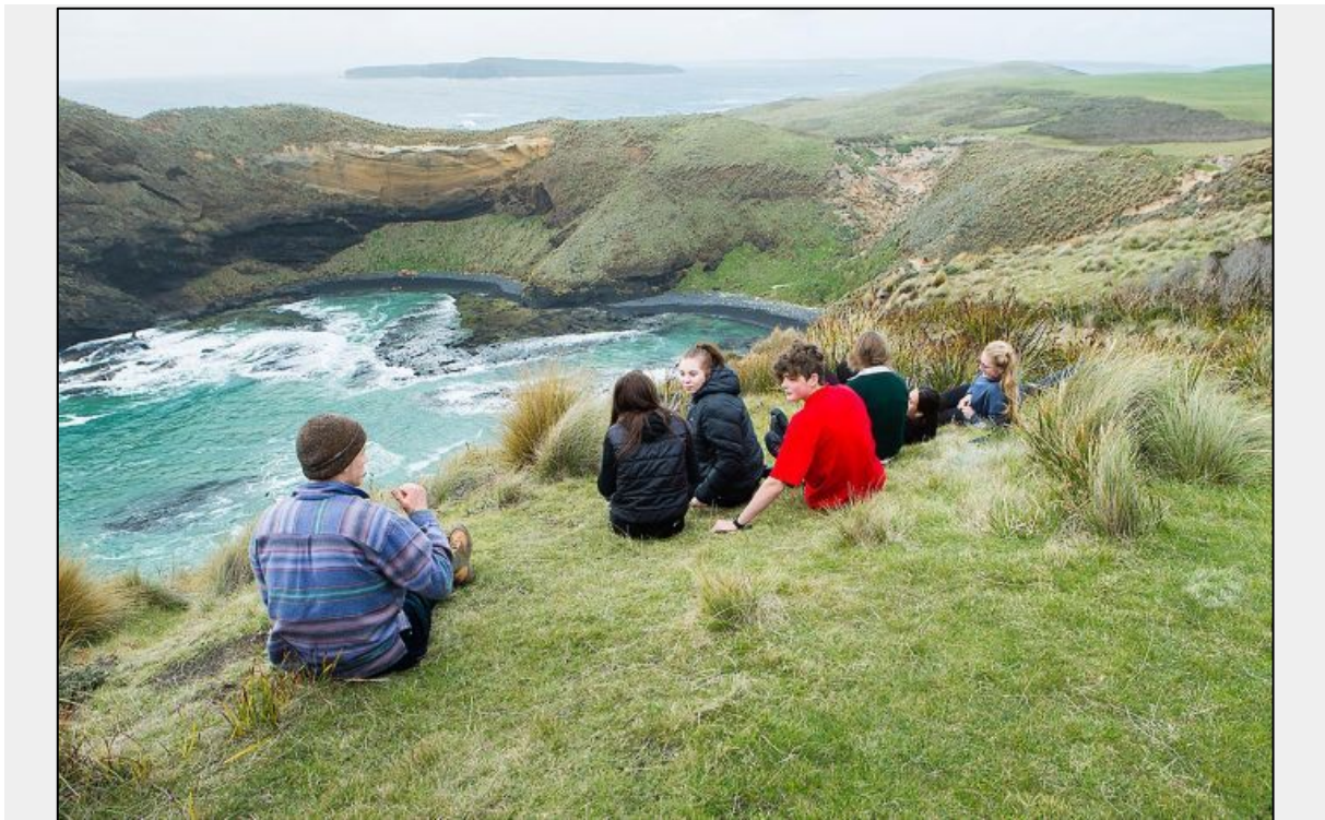
PHOTO Smithton High School students learning about the history of Cape Grim.

The State Government said the revised dual-naming policy, which will could see offensive names removed, is due to be completed by mid-year.