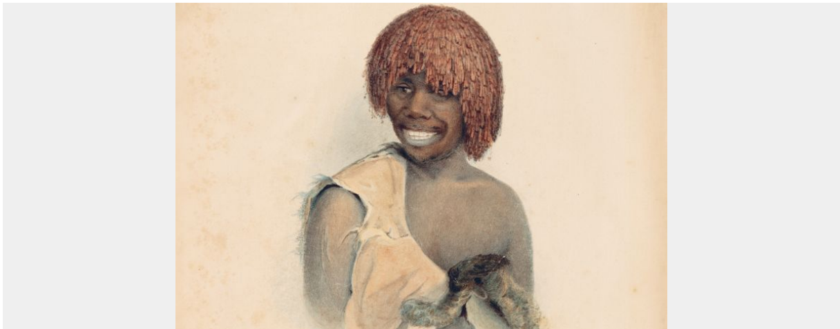
PHOTO Tunnerminnerwait witnessed the 1828 massacre as an 11 year old.