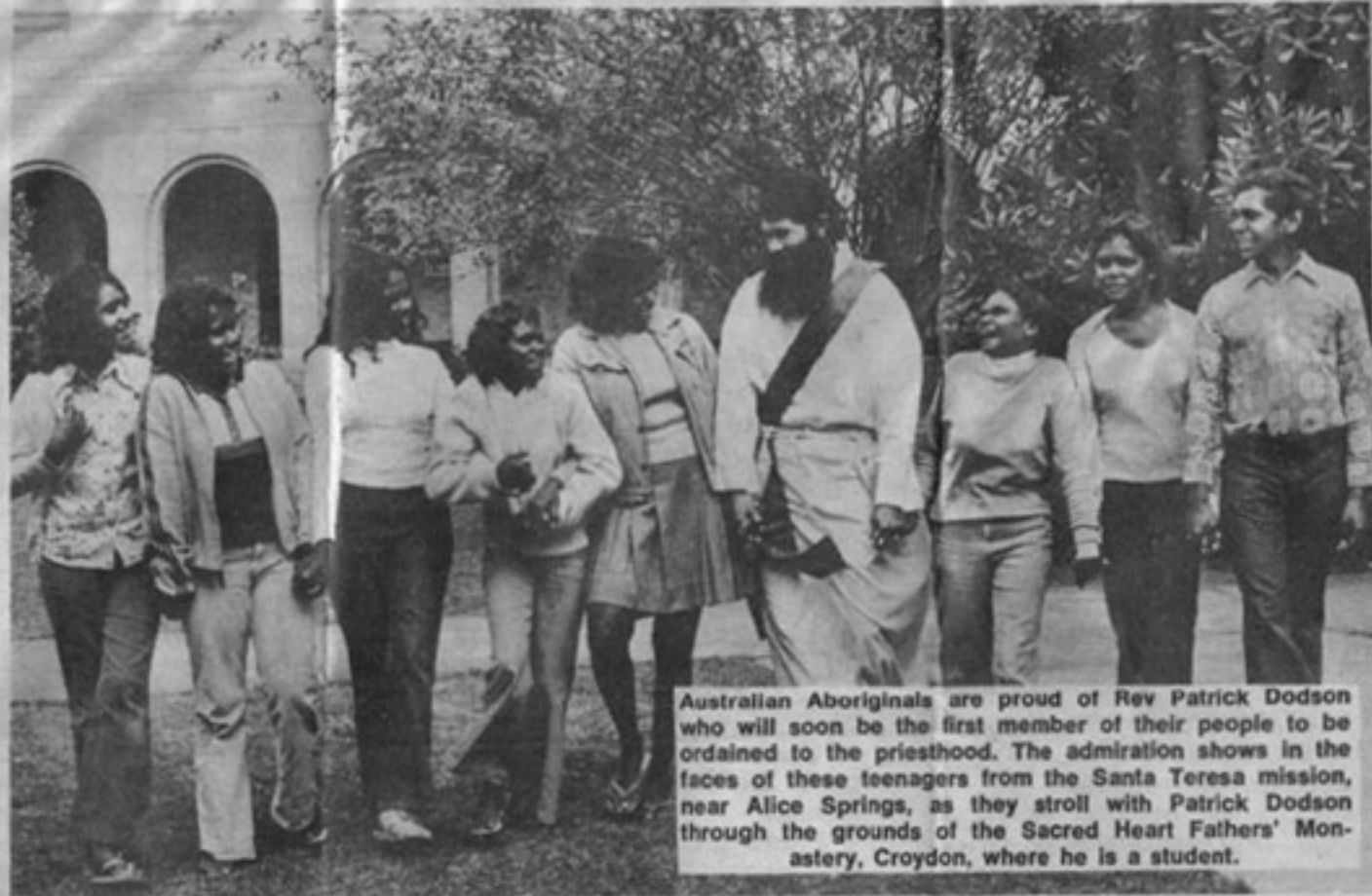
Australian Aboriginals are proud of Rev Patrick Dodson who will soon be the first member of their people to be ordained to the priesthood. The admiration shows in the faces of these teenagers from the Santa Teresa mission, near Alice Springs, as they stroll with Patrick Dodson through the grounds of the Sacred Heart Fathers' Monastery, Croydon, where he is a student.

The dark brown hands of Patrick Dodson flow gracefully as he tells of the past 10 months he has spent working as a deacon in north-west Australia.