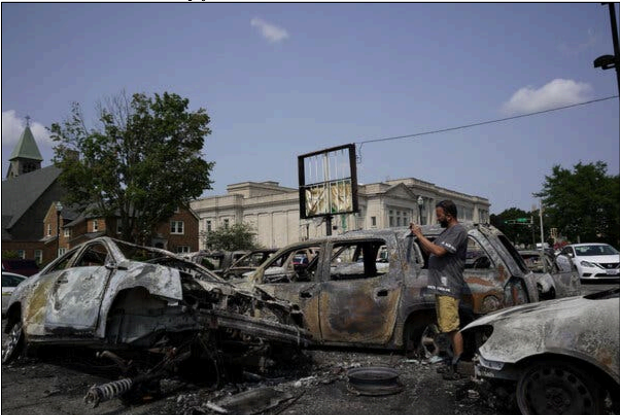
The shells of cars burned on Sunday remained near the Kenosha County Court House on Monday.

Around Kenosha on Monday morning, dump trucks that had been set ablaze outside the county courthouse were still sending an acrid smell through the air. Stunned shop owners swept up glass that had been smashed overnight, and boarded up their storefronts with sheets of plywood.