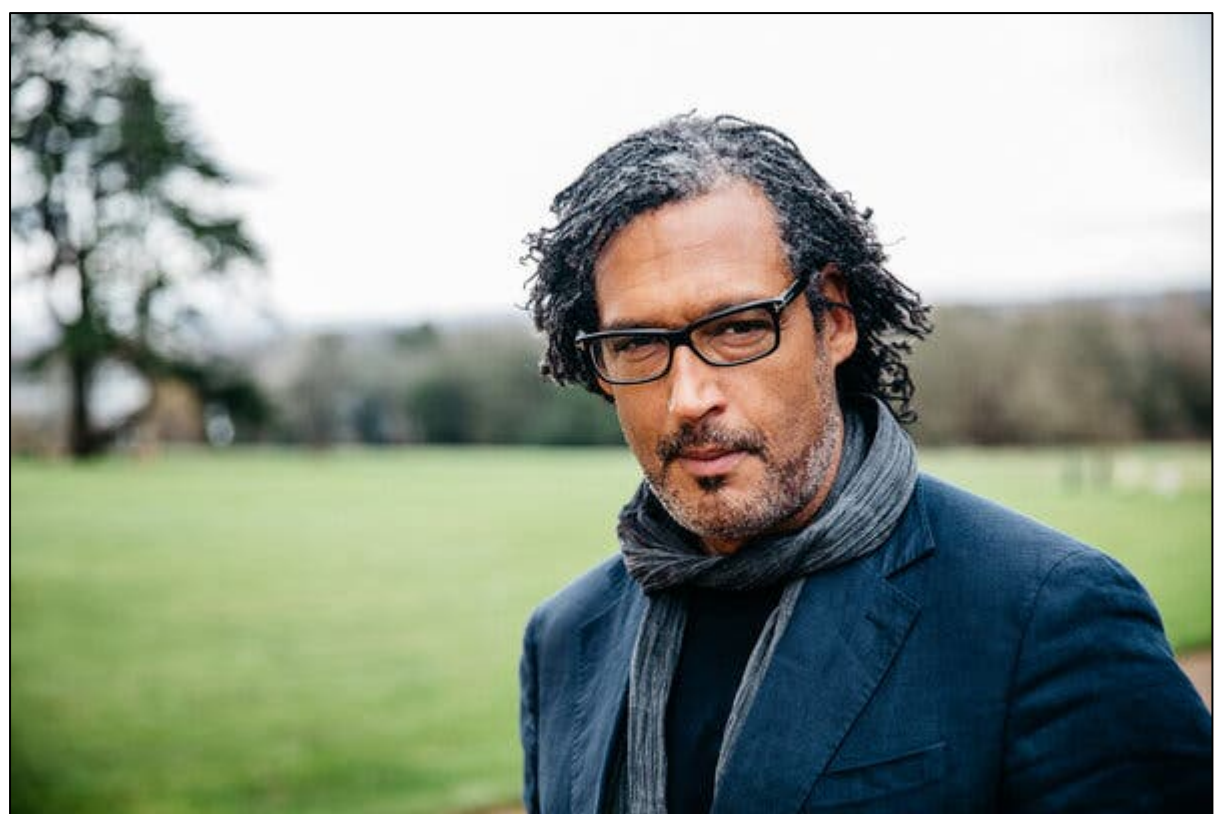
Olusoga studied history but opted for a career in television over academia, as he believes history is "naturally public."

But, "if you only want to tell yourself the positive stories from your past," he said, "then that necessarily means you cannot have an honest reckoning with your past."