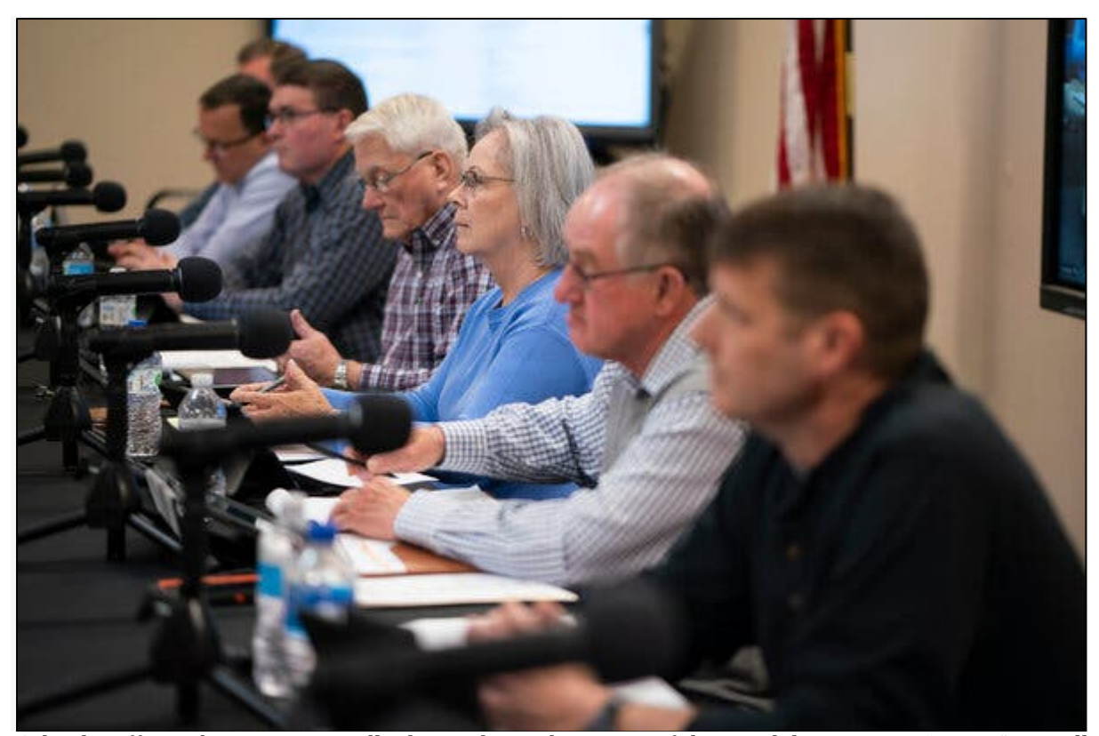
School staff members were initially directed to redact some of the rough language in "Maus," as well as a nude image. But the school board decided that wasn't enough.

The decision to remove "Maus" began around the beginning of the current semester with complaints from parents and teachers, according to school board members. The district had recently switched to a new curriculum provider, and it was the first time that the book would be assigned.